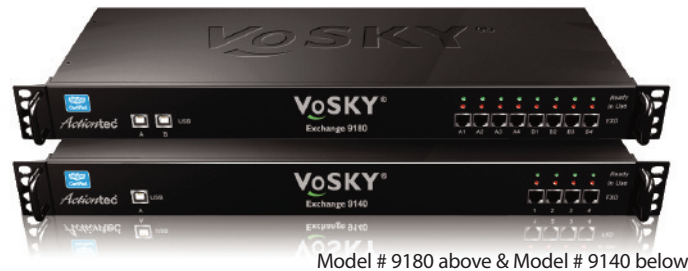
Model # 9180 above & Model # 9140 below